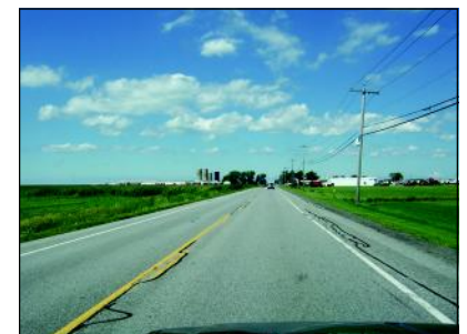
Current conditions found along Route 98 - predominantly farmland and some commercial businesses on West Saile Dr.

A build-out analysis was provided to determine the extent of the development that could occur in these areas between 2010 and 2035. The analysis shows the full future build-out of developable lands (vacant & agricultural) in the study area based on current zoning and subdivisions regulations. This was a conservative estimate and is dependent on various outside factors, including market conditions and whether the zoning regulations are maintained or revised. This information was used to estimate future infrastructure demands as well as testing the practicality of existing zoning and development regulations.