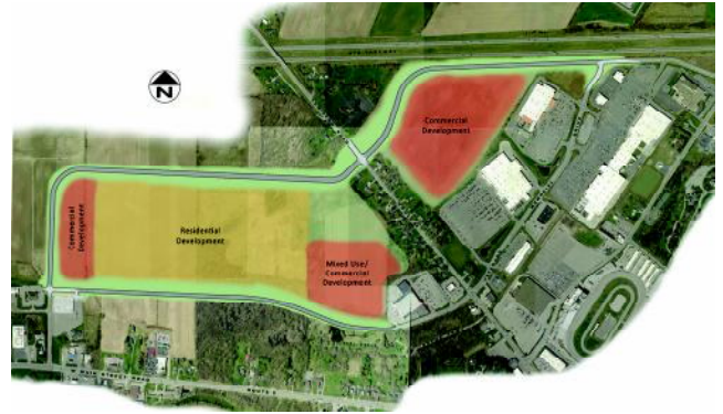
The Route 98 (left) and Veterans Memorial Drive (right) focus areas showing conceptual land uses and roadway alignments.

Through the planning process, various opportunities and strategies were identified to enhance mobility in the region. Although some of the more significant recommendations hinge upon long-term build-out, a proactive approach to minimize future traffic impacts will help ensure safe and efficient traffic operations in the future. Other opportunities for collaboration and partnerships should be pursued as development moves forward in the area and sections of the plan are implemented. This cooperative effort can be critical for specific funding opportunities as well as a cost-savings measure.