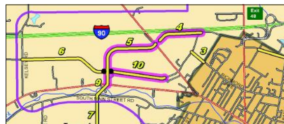
Segments 4, 5 & 10 are the preferred roadways based on the results of the traffic model. The numbers correspond to the proposed roadways outlined in the study (Section 5).