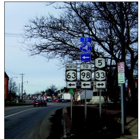
Five major roadways carry traffic to Batavia from various points in the region and State.

The Genesee County Corridor Study encompasses the entire City of Batavia and significant portions of the Town of Batavia as shown in the graphic at right. This central corridor includes the major roadways outlined above, as well as other existing and proposed federal aid eligible roadway systems. Collectively, the roadways in the corridor provide primary travel routes for local residents and employees, as well as commercial truck traffic and visitors.