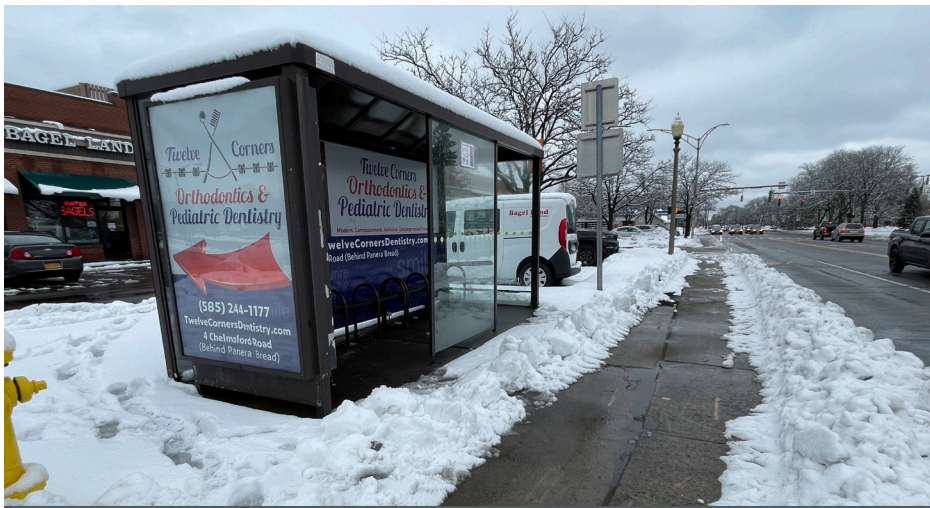
Bus stop and cleared sidewalk at Winton Road and Monroe Avenue (Twelve Corners).

In addition to the network development and other infrastructure changes recommended in previous tasks, policy and programmatic strategies and actions should play an influential role in the future of active transportation in Monroe County. The proposed network would significantly increase active transportation,