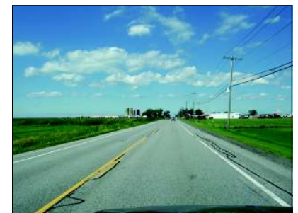
Current conditions found along Route 98 - predominantly farmland and some commercial businesses on West Saile Dr.

A build-out analysis was provided to determine the extent of the development that could occur in these areas between 2010 and 2035. The analysis shows the full future build-out of developable lands (vacant & agricultural) in the study area based on current zoning and subdivisions regulations. This was a conservative estimate and is dependent on various outside factors, including market conditions and whether the zoning regulations are maintained or revised. This information was used to estimate future infrastructure demands as well as testing the practicality of existing zoning and development regulations.