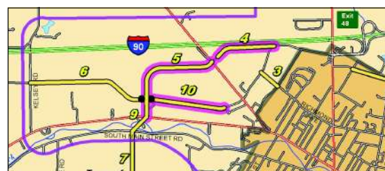
FIG 5.13: PROPOSED FUTURE ROADWAYS Segments 4, 5 & 10 are the preferred roadways based on the results of the traffic model. The numbers correspond to the proposed roadways outlined in the study (Section 5).