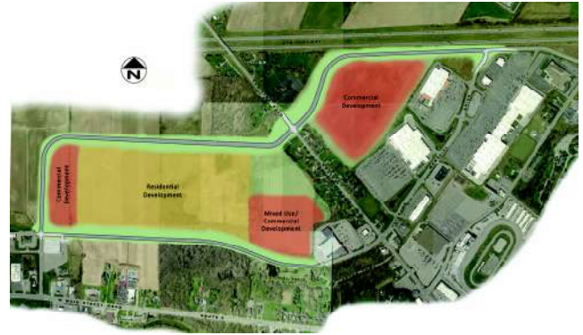
The Route 98 (left) and Veterans Memorial Drive (right) focus areas showing conceptual land uses and roadway alignments.

Through the planning process, various opportunities and strategies were identified to enhance mobility in the region. Although some of the more significant recommendations hinge upon long-term build-out, a proactive approach to minimize future traffic impacts will help ensure safe and efficient traffic operations in the future. Other opportunities for collaboration and partnerships should be pursued as development moves forward in the area and sections of the plan are implemented. This cooperative effort can be critical for specific funding opportunities as well as a cost-savings measure.