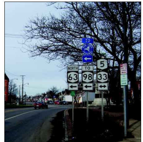
Five major roadways carry traffic to Batavia from various points in the region and State.

The Genesee County Corridor Study encompasses the entire City of Batavia and significant portions of the Town of Batavia as shown in the graphic at right. This central corridor includes the major roadways outlined above, as well as other existing and proposed federal aid eligible roadway systems. Collectively, the roadways in the corridor provide primary travel routes for local residents and employees, as well as commercial truck traffic and visitors.